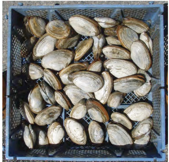
Figure 1. Softshell clams are typically white or gray and cannot close completely.

siphon extends through the sediments to the sediment/water interface. Cilia associated with the gills move oxygenated water with microscopic food, such as phytoplankton, bacteria and small organic particles,