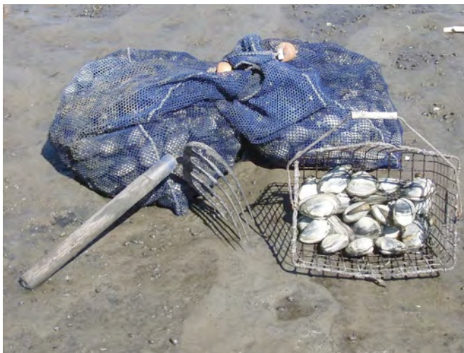
Figure 3. Softshell clams are harvested from intertidal waters by hand rakes and stored in bags for transport to wholesalers.

Softshell clams are marketed and consumed almost exclusively as a cooked product, either steamed or breaded and fried. Steamed clams are boiled or steamed