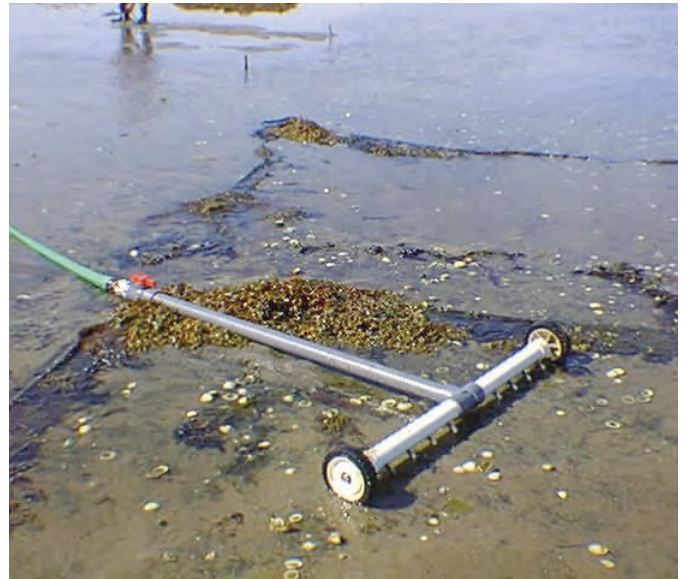
Figure 4. Hydraulic rigs are used to harvest softshell clams from subtidal waters.

in their shells, piled on a plate and ingested whole by the consumer, after removing the shells and tissue that surrounds the siphon. Commonly, clams are dipped in melted butter or other sauces before being consumed. Fried clams are shucked, breaded and deep-fried whole. Preferred size for steamed or fried clams is 63 to 76 mm SL. The edible portion of softshell clams (35% by weight) greatly exceeds that of other commonly consumed bivalve mollusks such as oysters (13%), scallops (18%), and hard clams (18%). Softshell clams are high in minerals, such as iron, zinc, magnesium, potassium, copper, and phosphorus. These minerals help build healthy blood cells, promote immune reactions, make proteins, promote muscular strength, healthy skin, and help build healthy bones. Twenty steamed clams without melted butter have 133 calories with 0.2 g of saturated fat, 23 g of protein and 60 mg of cholesterol.